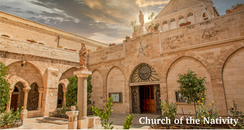
Church of the Nativity