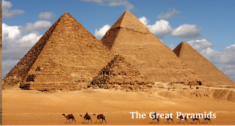
The Great Pyramids